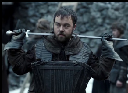
Oh those dirty looks. Rast © HBO 2011.